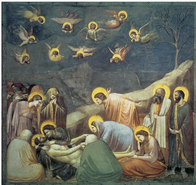
Lamentation of Christ by Giotto